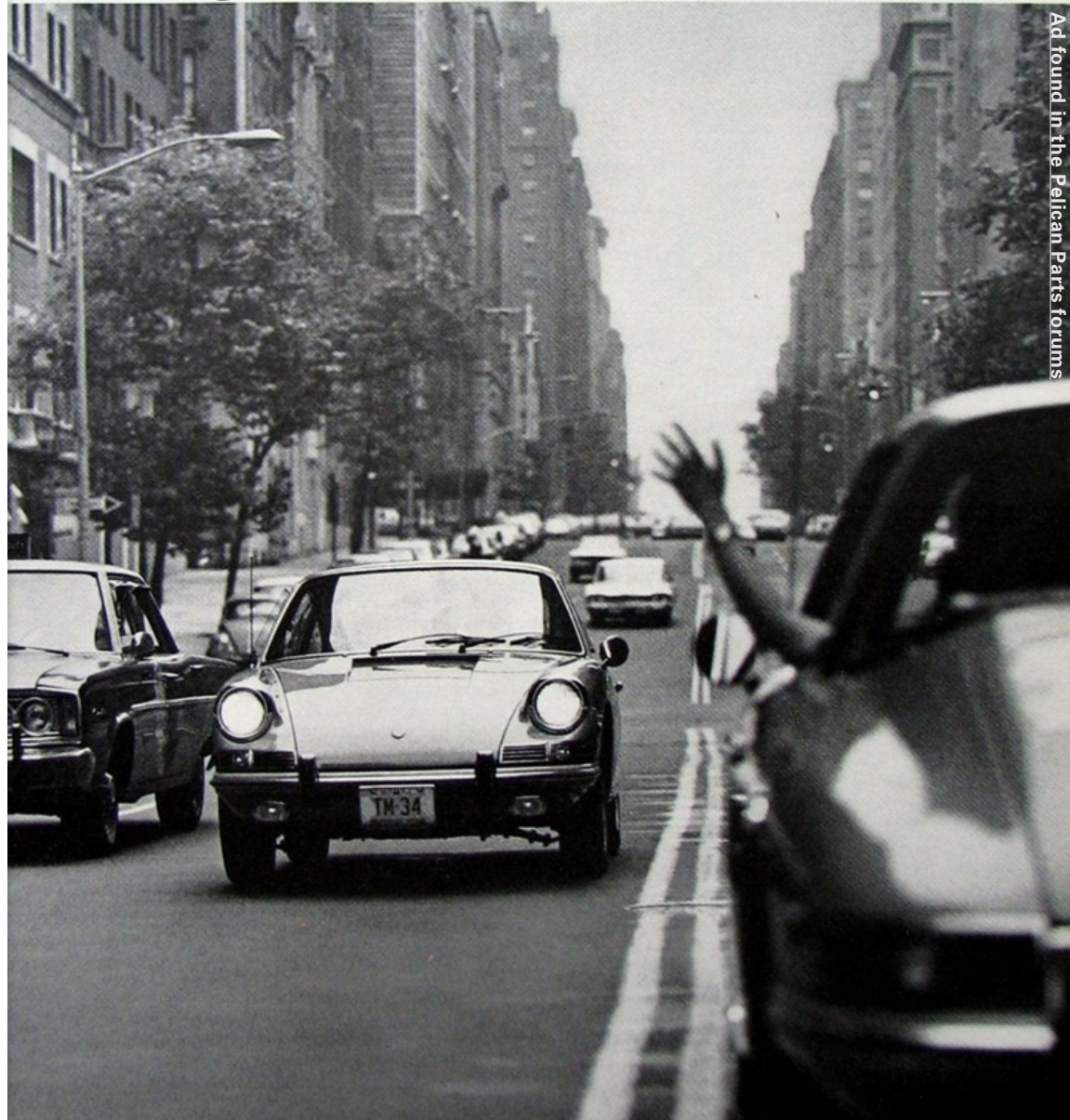
Ad found in the Pelican Parts forums