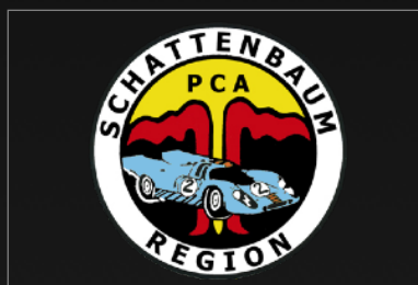
Porsche Tech Support Open techsupport@schattenbaum.org